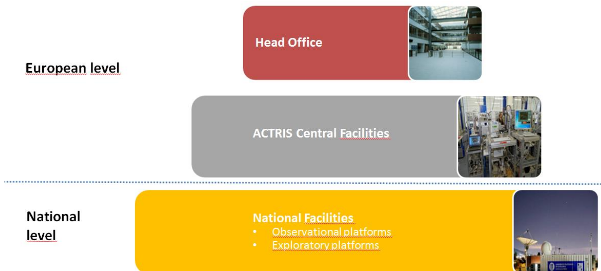
Figure 1: ACTRIS structure including both the European level and national level components.

The proposed structure of ACTRIS consists of National Facilities (NF) and Central Facilities (CF). ACTRIS National Facilities are observational and exploratory platforms producing ACTRIS data and offering physical access for users. The ACTRIS Central Facilities (CFs) are European level components of the ACTRIS research infrastructure providing important services both for the ACTRIS National Facilities and for external users of the ACTRIS. These include ACTRIS Centres for instrument calibration and other services related mainly to data quality, ACTRIS Data Centre and ACTRIS Head Office. The Central Facilities are the key operative entities of the RI in charge of the quality assurance and quality control of the ACTRIS measurements and data. In the operational phase the ACTRIS Central Facilities are required to ensure that all data are produced, treated and quality controlled, properly archived for long-term usage, and accessible in a timely manner to all ACTRIS end-users. The planned structure of ACTRIS is explained in figure 1.